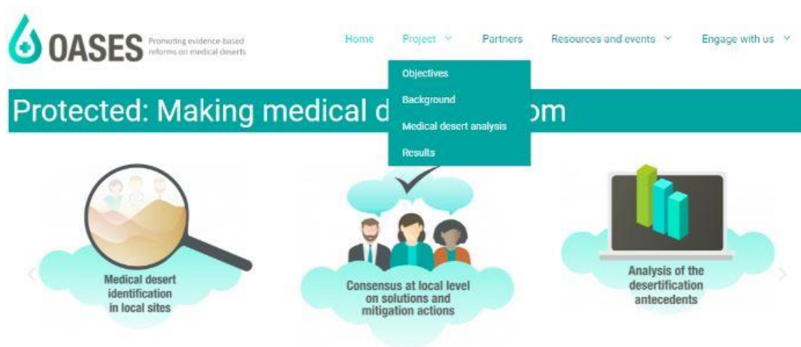
Figure 3 – ‘Project’ menu of the OASES website

Section 3 presents the screenshots of the OASES project website’s menus. The ‘Project’ menu presents the objectives of OASES project, some information of the background, describes the medical desert analysis to be carried out in the project and has a dedicated menu for sharing the public results (Figure 3).